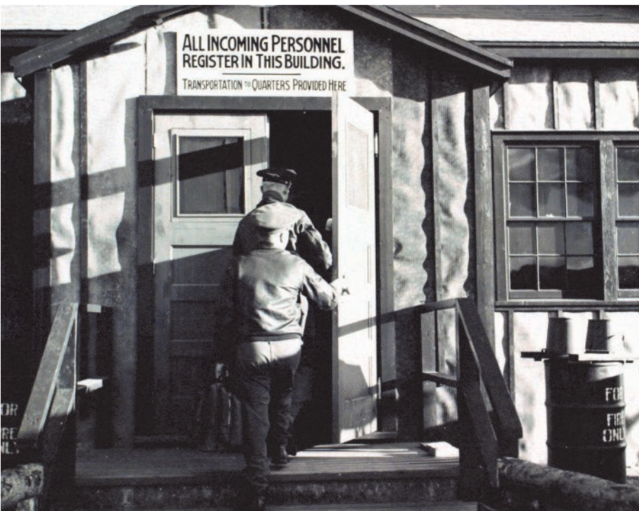
Incoming personnel processing area, Goose Bay, Labrador, circa 1944.

The B17, sleek as it may seem in photographs and on the television screen, was slow and had no cocktail bar. And the temperature inside was the same as the temperature outside. Cruising airspeed was about 150 and the average altitude flown on that trip was probably 8,000 feet, down there where all the clouds were. It took us probably eight and a half hours to fly from Lincoln to Bangor. Today a twin-engine Boeing 737 would fly that in two