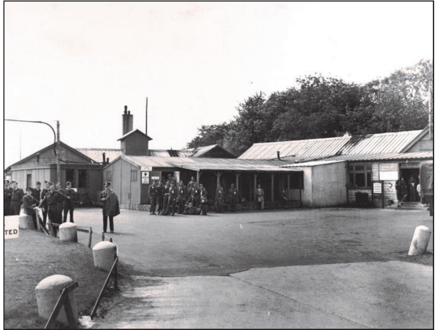
Air crews and other Army Air Force personnel waiting for transportation, Transient Air Transport Terminal, Prestwick, Scotland, circa 1944-1945.

From my position on the floor I couldn't see out. I knew what was happening through other senses but not from sight. So when the engines stopped, I thought the braking would not be a problem, and we would stop before reaching the end of the runway. I sat there waiting, my back to the door into the bomb bay. I first knew we had a problem, a big one, when we ran off the pavement and into the rocks at the end. I couldn't see this, of course, but when the plane began rocking violently and the noise of strained and tortured aluminum became deafening it was apparent that we were totally out of control and crashing across the rock-strewn ground.